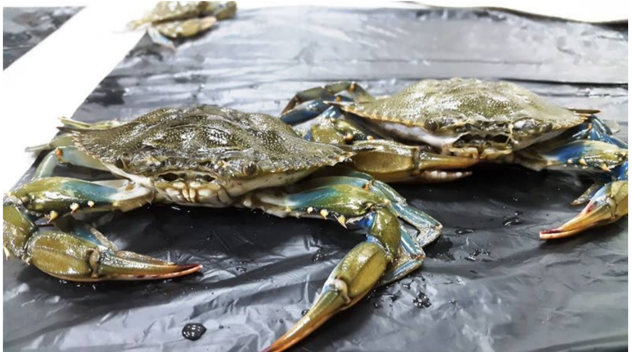
Callinectes blue crabs serve as prey for larger marine fauna or predator to small clams, mussels and smaller crabs.

sesarmids). The “iron back” or blue land crab ( Cardisoma guanhumi ) is another land crab of commercial value, this being the main element in the traditional crab and dumpling dish. This species is more omnivorous in nature, feeding on leaves, insects and decaying matter. While both the hairy and blue land crabs are sources of income for local crab vendors, a report by the Centre for Resource Management and Environmental Studies, UWI, Cavehill in 2014 warned of the exploitation and over harvesting of these crabs, as the fishery tends to involve both unchecked small scale and recreational harvesting. A lot is still unknown about the population status of these species and the ecosystem services they provide.