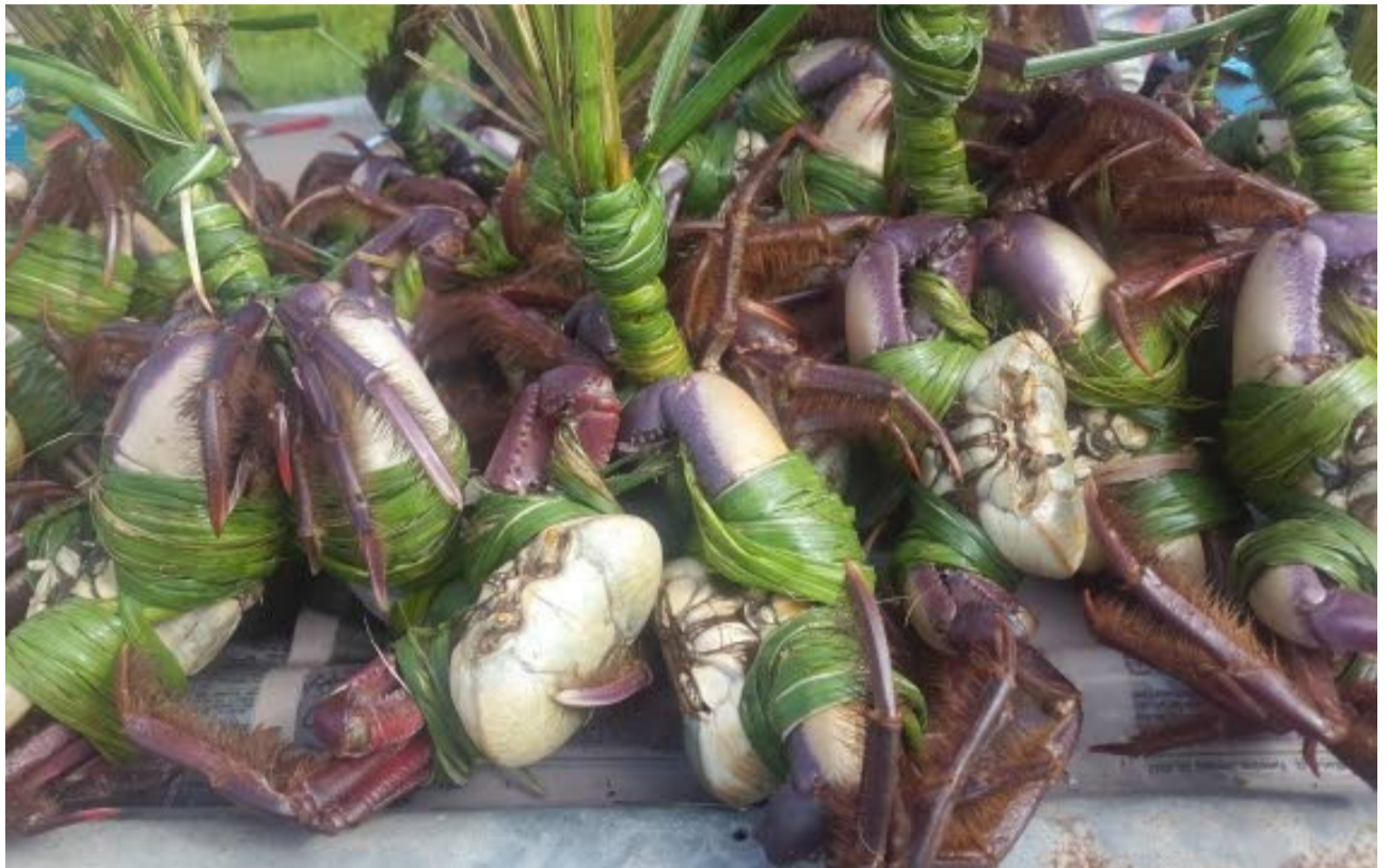
The hairy land crab, Ucides cordatus , can be seen tied together and sold by vendors.

particular group to have a preference toward certain food types such as carrion or animal based food. For instance, carnivorous types such as the marine/brackish species ( Callinectes sapidus ) prey on mollusks, polychaete worms and other marine invertebrates.