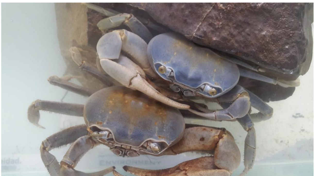
Cardisoma guanhumi or iron-back crab is popular in local dishes but the population status of this species is of major concern.

Alternatively, herbivorous crabs fill the role of proficient processors of low nutrient food sources, supporting essential food chain links in generally low productivity systems. For example, a cultural favourite in local dishes is the mangrove crab, Ucides cordatus or “hairy” land crab, which feeds on mangrove leaf litter; which most herbivores and decomposers find unpalatable.